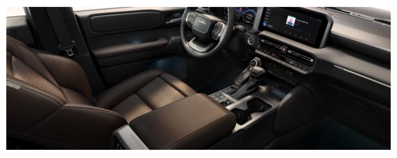
Chestnut leather (LB40) (Platinum)