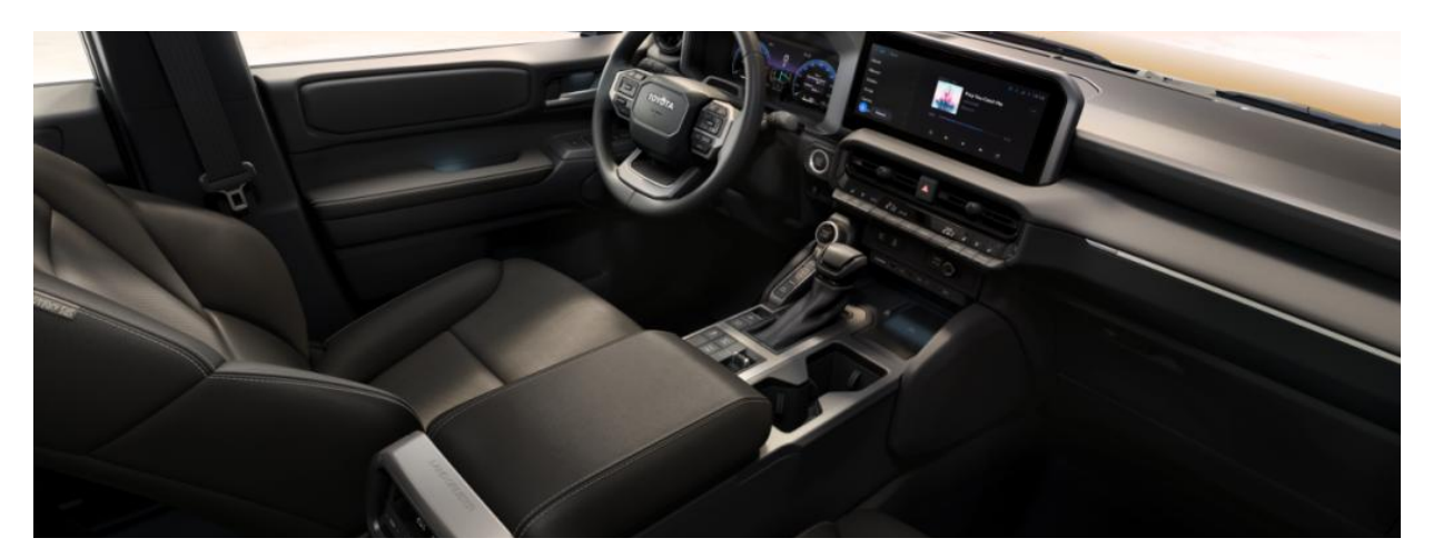
Black leather (LB20) (Platinum)