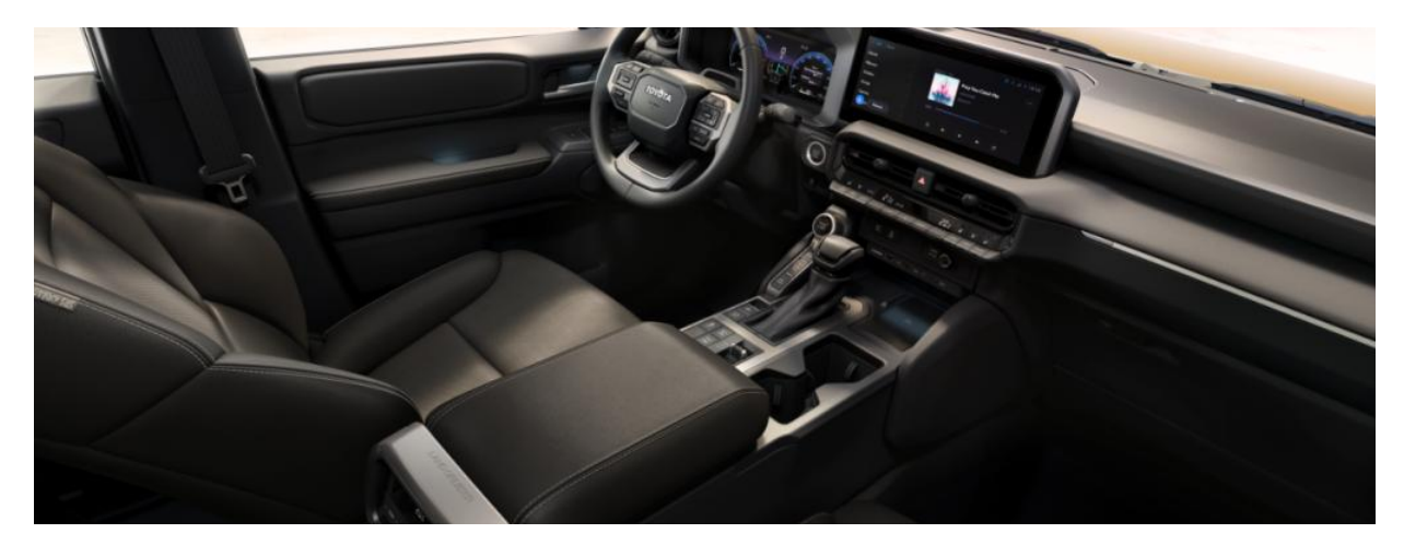
Black synthetic leather (EA20) (Landcruiser) *Image is for illustrative purposes only

For the Platinum grade, you can choose between two colours, while the Land Cruiser grade comes exclusively in black. All grades feature a unified black instrument panel, delivering a fresh and modern look.