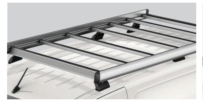
ALUMINIUM ROOF PLATFORM COMPACT (MWB) Heavy duty aluminium platform with integrated roller bar to facilitate loading.