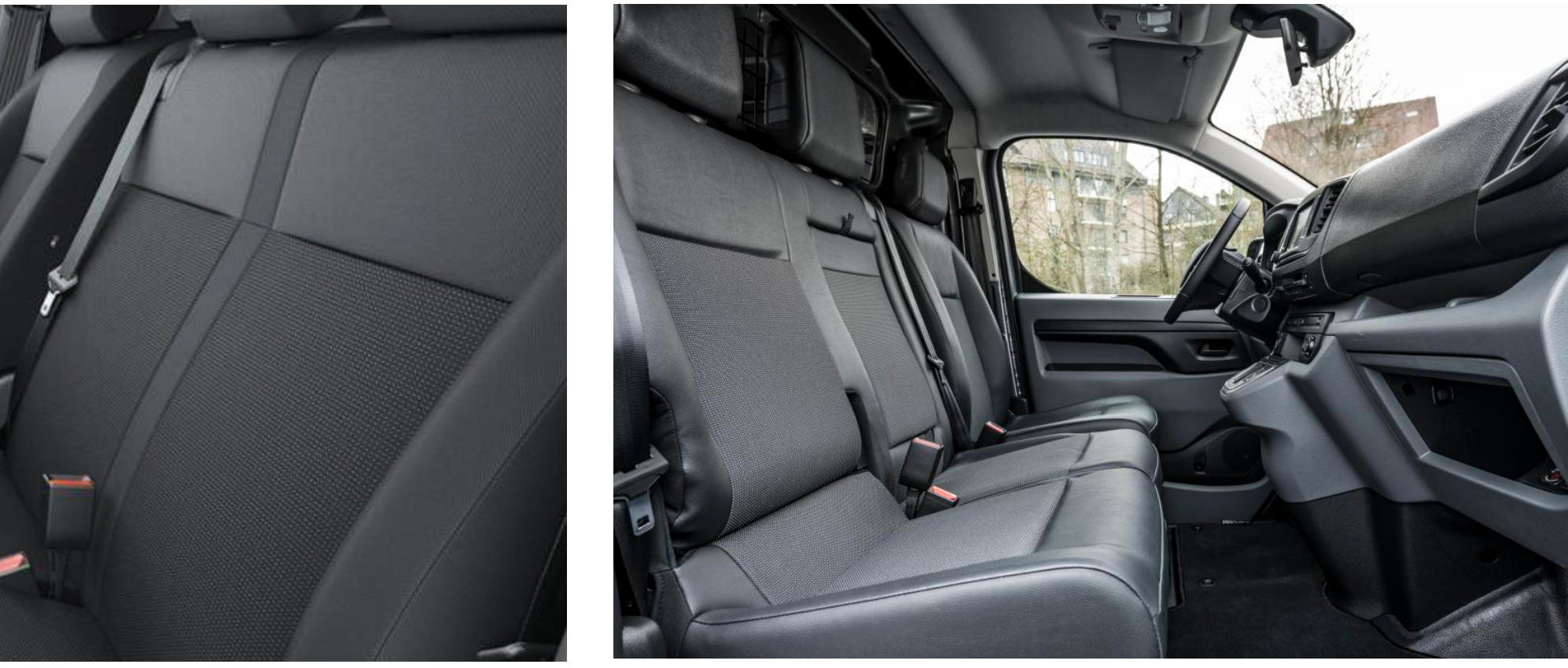
Dark grey fabric (43FT)

Available in dark grey fabric with a unified black instrument panel that delivers a fresh image.