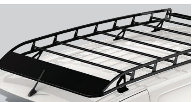
STEEL ROOF PLATFORM FOR COMPACT (MWB) Heavy duty steel platform with integrated roller bar to facilitate loading.