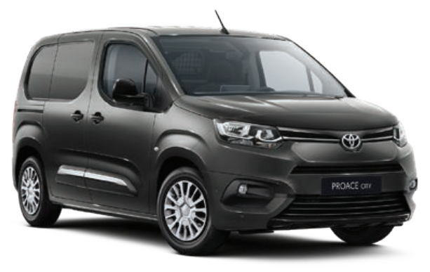
Dark Grey (EVL)