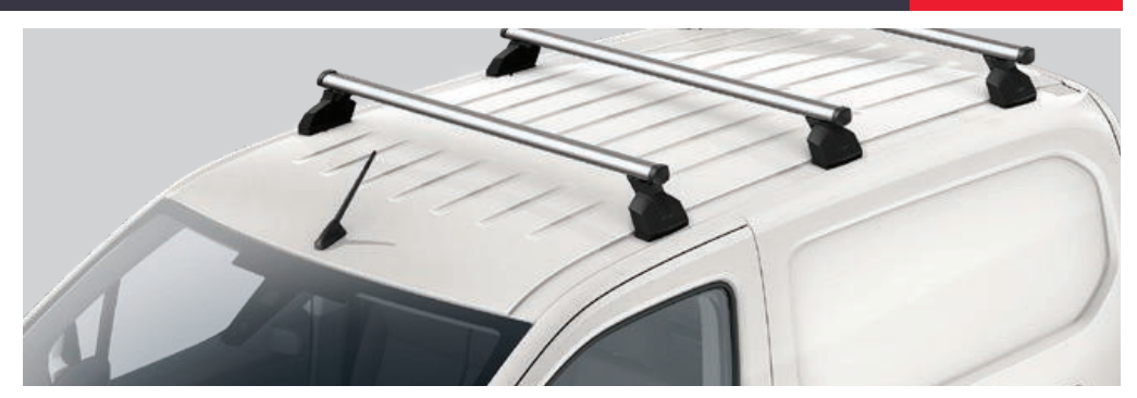
ROOF RACK (2 BARS)

Lockable aerodynamic aluminium design that is easy to install and remove. It combines with a wide range of specialised carrying attachments.