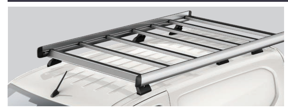
ALUMINIUM ROOF PLATFORM FOR SWB Heavy duty aluminium platform with integrated roller bar to facilitate loading.