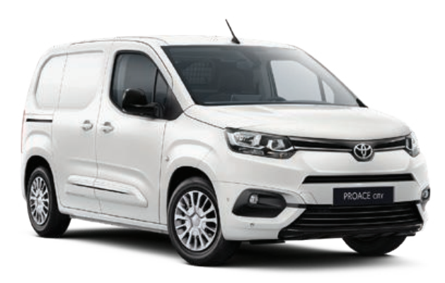
Icy White (EPR)