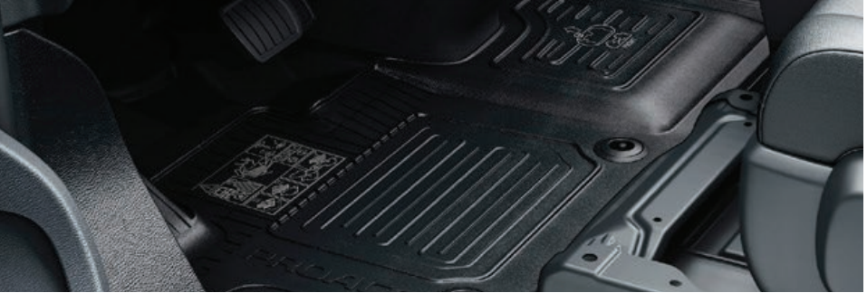
RUBBER FLOOR MATS The ultimate floor protection against mud, water, dirt and grime.