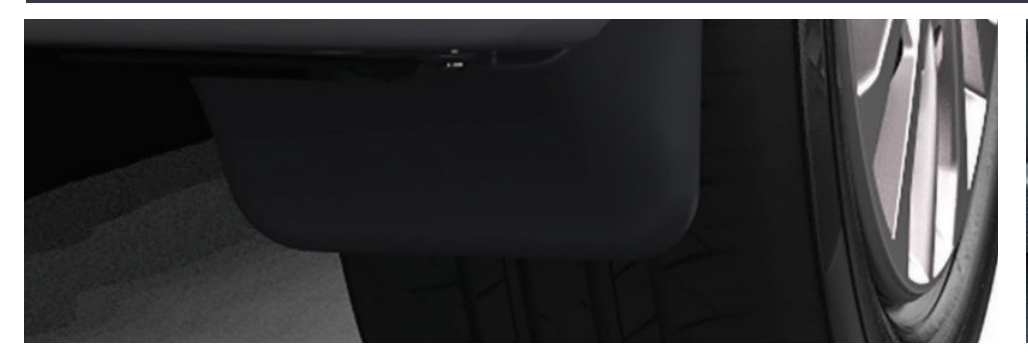
MUD GUARDS Designed to minimise water, mud and stones spraying onto your van's body.