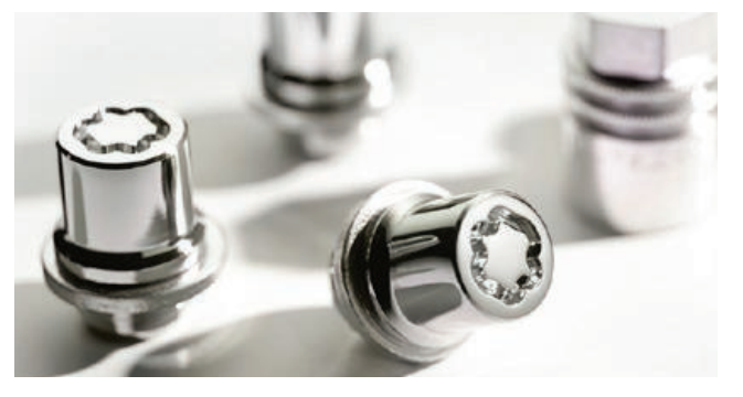
LOCK NUTS Replacing one nut on each wheel with a Toyota hardened steel wheel lock will maximise security for your valuable alloys.

FRONT & REAR MUD GUARDS Designed to minimise water, mud and stones spraying onto your car's body.